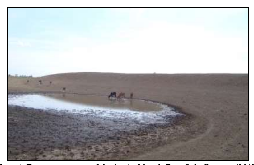
Plate 1: Dry water pan at Mosiro in Narok East Sub-County (2017).

The exciting revelation of the linkage between psychological threats and impacts of climate change is similar to the findings of Ndamani and Watanabe (2015). Furthermore, according to Nxumalo (2012), the impacts of climate change have led to low agricultural productivity in subsistence farming and hence negatively affecting the livelihoods of most households. The same was also cited by Barbieri et al. (2010) who pointed out that the impacts of climate change in Brazil were more likely to expose residence to extreme events with potential negative outcomes to food production and poverty. These results are also in agreement with Alinovi et al. (2010) who indicated that the vulnerability context of pastoralist towards pursuing their livelihoods can be heavily influenced by impacts of climate change, which have a direct impact on their assets and on the options available to them to pursue other beneficial livelihood option.