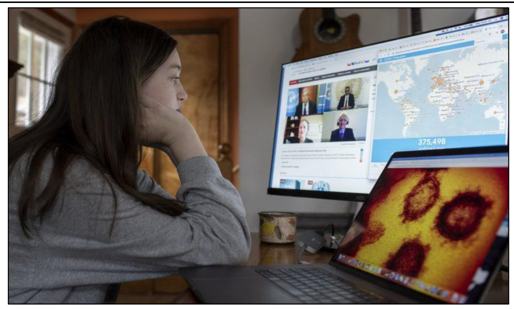
Picture 1: Information on measures about COVID-19

On 8<sup>th</sup> April 2020 the findings showed that 86 percent (167 countries) have provided information and measures about COVID-19 on the portal. Not only information regarding COVID-19 was provided on different portals of government but also during the crisis, government were encouraged institutions whether government or private to work from home in order to curb the spread of the COVID-19.