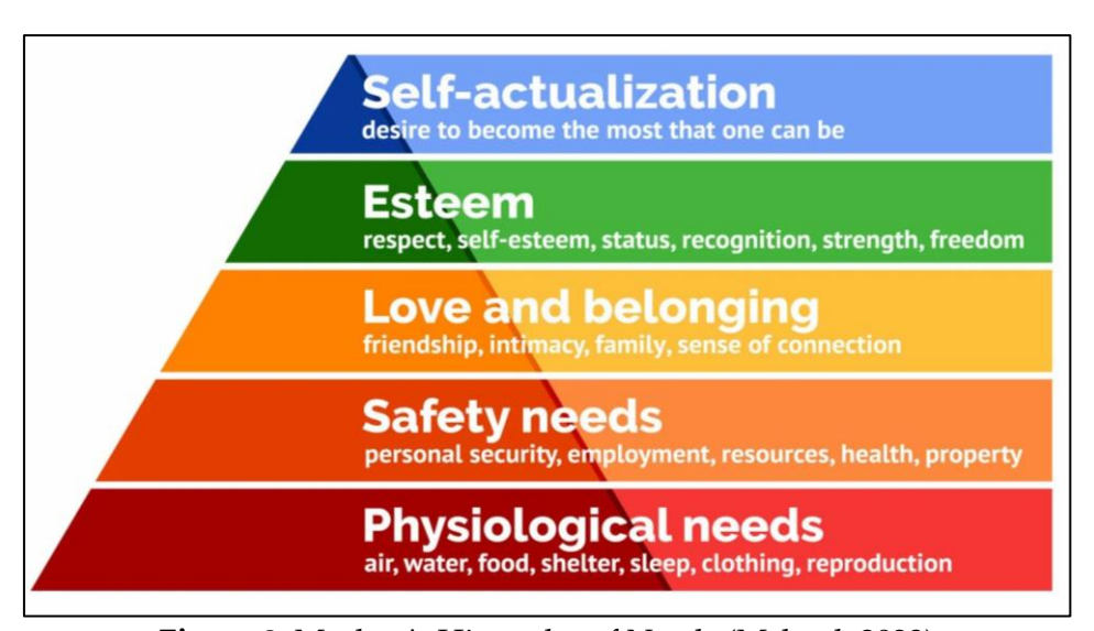
Figure 2: Maslow's Hierarchy of Needs (Mcleod, 2023)

What it means in terms of retention: Evaluate your employee experience concerning the hierarchy of needs. To increase retention, focus on the gaps at the pyramid's base.