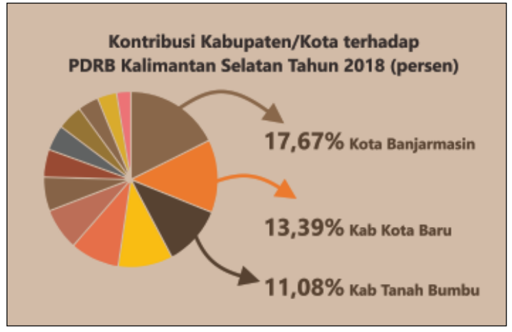
Figure 2: Contribution of Districts / Cities to South Kalimantan's GRDP in 2018 (percent)