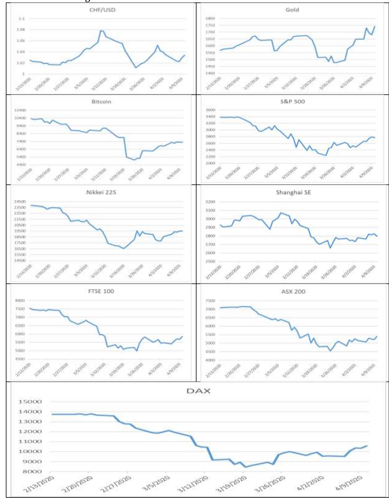
Figure 2: Stock Markets and Safe Haven Assets Performance