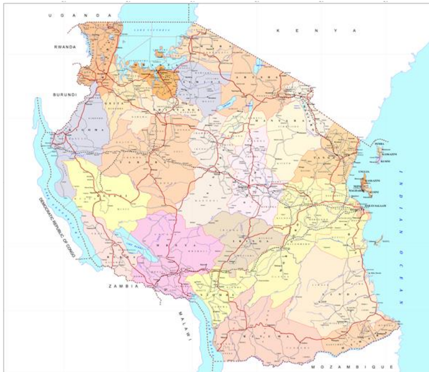
Map: The United Republic of Tanzania

As for the language, the official website of Tanzanian website is shown in two languages, namely, Kiswahili and English. Kiswahili is the national language and is regarded as the united language for people between ethnics to communicate. Both Kiswahili and English are the official languages, while the former is the medium of instruction at primary school level, social and political spheres; the latter is the medium at higher educational levels, technology, and higher courts. English serves the purpose of providing Tanzanians with the ability to participate in the global economy and culture. Virtually all of Tanzania's inhabitants speak Bantu languages. Among the 158 ethnic groups, there are Bantu, Nilotic, Khoikhoi and Cushitic speakers v .