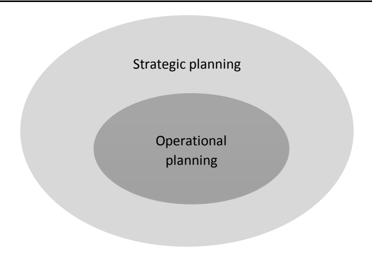
Figure 1 : Comparison of strategic to operational planning.