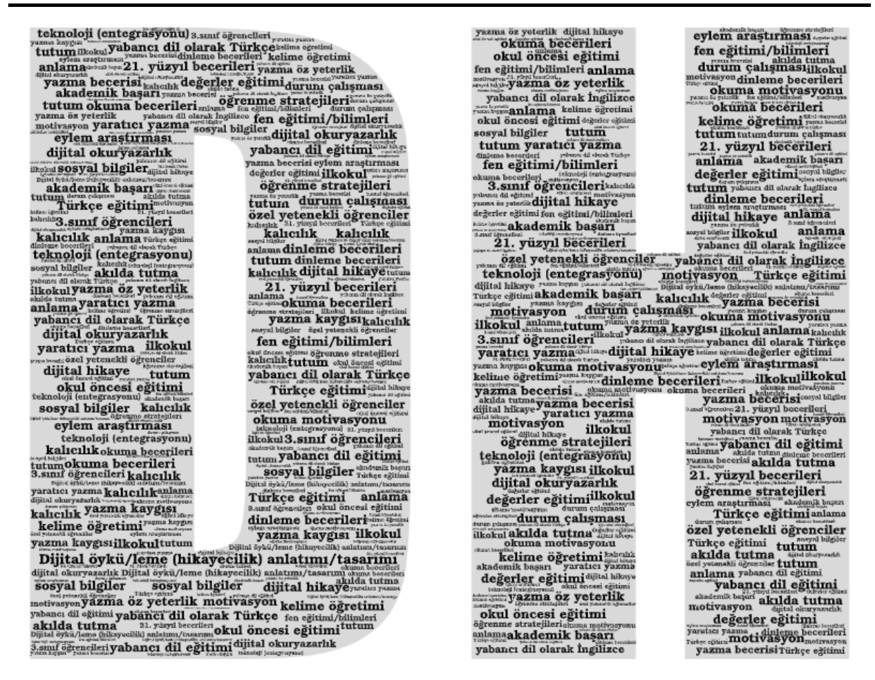
Figure 3: Word cloud created with the key words