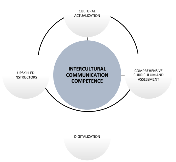
Figure 2: Conceptual Model of Interdependent Theory of Intercultural Communication Competence

Intercultural Communication Competence is interdependent on cultural actualization, comprehensive curriculum and assessment, digitalization, and upskilled instructors. All these elements must be present to effectively develop and enhance the Intercultural Communication Competence of learners. The interdependence of all these elements strengthens interculturally oriented teaching-learning practice in the development of Intercultural Communication Competence in ESL/EFL classes. Moreover, the interdependence of these elements emphasizes technically and academically equipped teachers to utilize appropriate materials, techniques, and strategies to enhance learners' ICC. This last component of this theory is vital and needs attention to deliver the objectives of ELT in relation to Intercultural Communication Competence. Thus, this theory is developed and shall be called the Interdependent Theory of Intercultural Communication Competence (Figure 2).