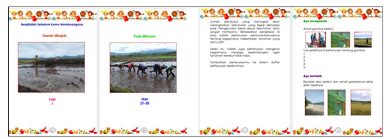
Figure 4: The Display of One of the Instructional Activities

In the content section of the electronic book, it consists of learning materials, discussions, and exercises. The learning material displays a lot of pictures based on local Ngada culture as well as videos that support learning activities. The display of learning activities is presented in Figure 4.