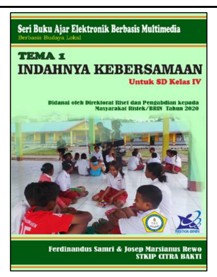
Figure 3: The View of Thematic Book Cover

In the content section of the electronic book, it consists of learning materials, discussions, and exercises. The learning material displays a lot of pictures based on local Ngada culture as well as videos that support learning activities. The display of learning activities is presented in Figure 4.