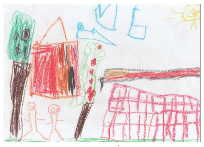
Figure 11: Drawing of İsmail Emir (2)

"This is an extending sofa; I think it would be more beautiful if it was colourful like that (it was drawn in multiple colours with bends) this is a heart-shaped green pillow. I could collapse these sofas easily and turn them into different forms."