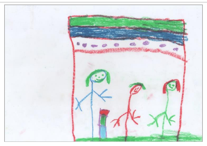
Figure 16: Drawing of Didar (1)

"The door of this school turns into multiple colours and its lamp (he/she wants to draw a ceiling) also becomes colourful, it is always different, the way you want it."