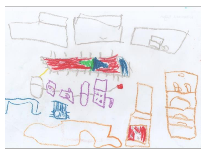
Figure 14: Drawing of M. Kağan (1)

generate new suggestions. Moreover, they found out that it was possible to integrate various functions into a positive design, and from this point of view they could imagine new designs with multiple functions which combined various possibilities (Figures, 14, 15 and 16). These findings indicated the accuracy of acquisitions that support creative thinking by keeping children in a changeable environment.