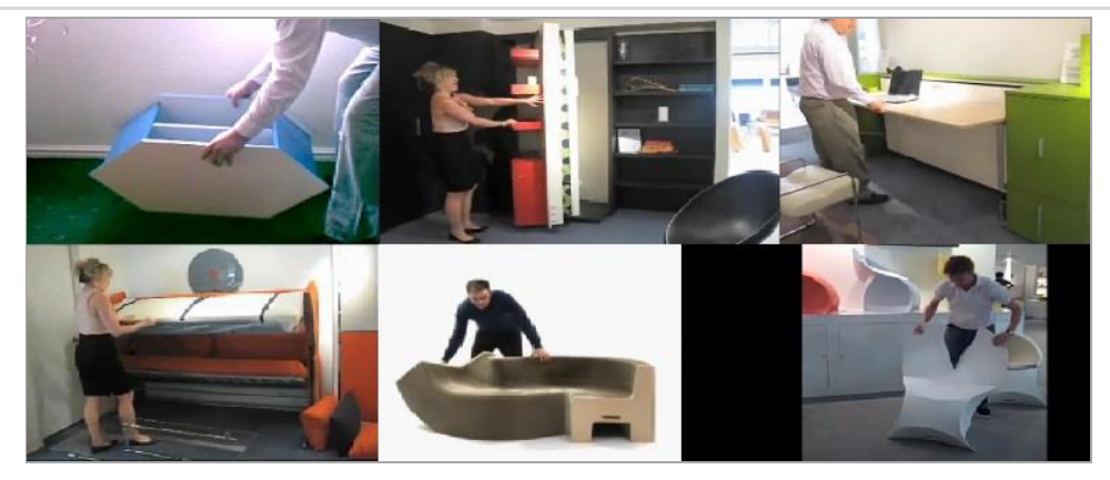
Figure 7: Frames from the short-movie

In the following phase of the study, picture drawing was included as a method in which children could express their thoughts individually. In this study, the statements of the children on the pictures they drew were taken into consideration (Thomson, 2008; Holmes, 2005). In order to eliminate the possibility that there might be a difference between the associations evoked in the mind of the researcher and the thoughts of children, which is emphasized as an important issue in visual study processes of various studies, one-to-one dialogues were established with children and their comments on these pictures were evaluated. Time was given to children for telling what they saw in their own drawings.