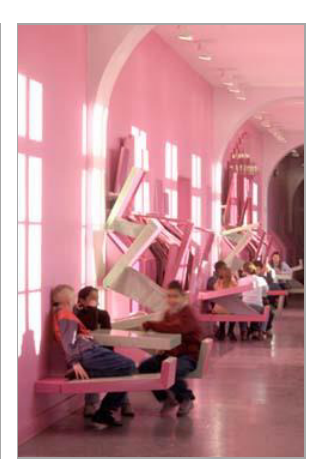
Figure 2: Erika Man Elementary School

(http://www.baupiloten.com/archiv/en/projekte/emg1/slideshow4/01.html; http://www.baupiloten.com/archiv/en/projekte/emg1/slideshow4/07.html; http://www.baupiloten.com/archiv/en/projekte/emg1/slideshow4/06.html).