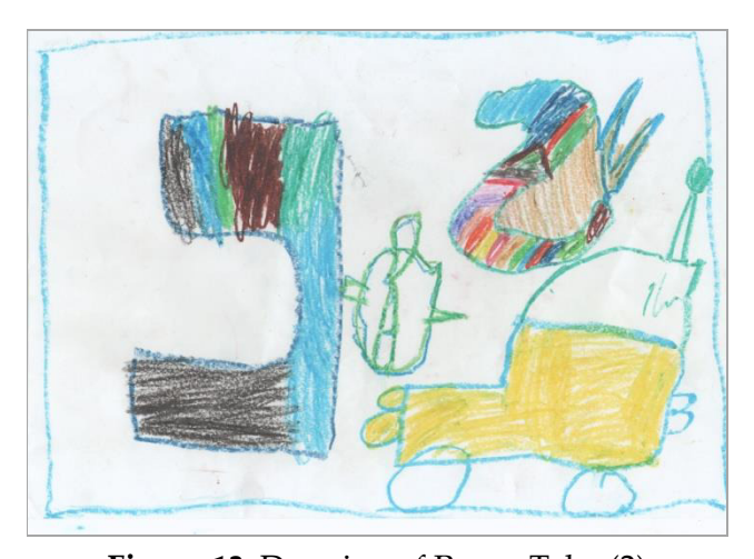
Figure 13: Drawing of Recep Taha (2)

"A double-decker, sometimes it changes colours. This is also a bendable sofa but mine is more fancy (coloured)."