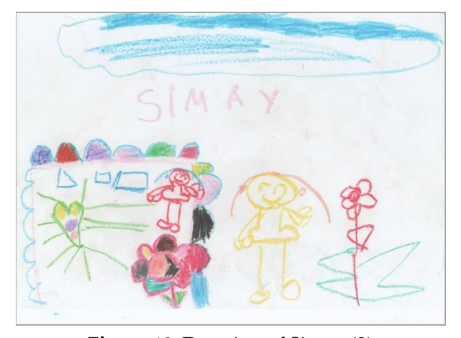
Figure 10: Drawing of Simay (2)

to reinterpret the changeable designs, which they had seen before, in order to make them suitable for their own desires and requirements. In these suggestions, it was observed that the furniture which was light brown due to its raw material paper, which was identified by them as an extending sofa, could be reinterpreted by children in a way to reflect the diversity they looked for; they reflected that furniture with its new colourful form in accordance with the existing function which they liked (Figures, 10, 11 and 12), and moreover they suggested different functions for that design which could be used for various purposes as a seating element (they imagined the extending sofa as a bridge and/or road for their cars) (Figure 13).