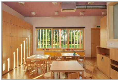
Figure 5: Kekec Kindergarten

(http://ad009cdnb.archdaily.net/wp-content/uploads/2011/03/1299532195-kekec72dpi-18.jpg; http://ad009cdnb.archdaily.net/wp-content/uploads/2011/03/1299532050-kekec72dpi-8.jpg; http://ad009cdnb.archdaily.net/wp-content/uploads/2011/03/1299532275-kekec72dpi-26.jpg).