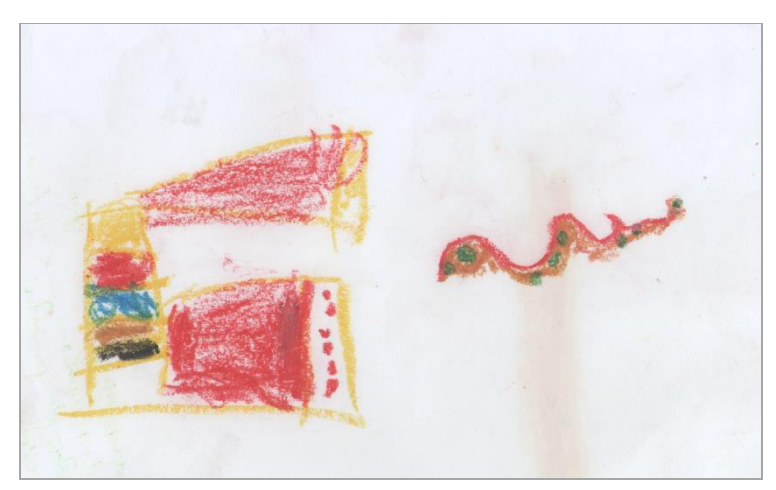
Figure 12: Drawing of Minel Sude (1)

"This is our shoe cabinet (with the triangle form on top) and this can be turned into a bed but ours cannot, we could lie when we are tired. These are the windows without grills (with purple frames) and this is the extending sofa, I would like it if it was colourful, it would be more beautiful in that way. Also, the blue sofa can be changed."