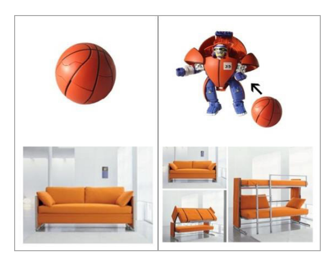
Figure 6: Two samples used in photo-conversation form

order to canalize the subject, the questions as "whether they have such toys or not, what are these toys used for, how it feels to change them, what the differences of these toys from the others are, and whether it becomes boring to change these toys after a while" were directed. Their teachers and parents were asked whether they had any opinion on the choice of their children, which toys they would prefer for them and the reason behind this.