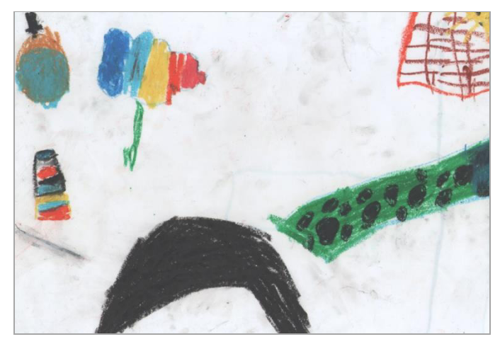
Figure 9: Drawing of Sude (1)

Almost all children reflected the nature of changeability in their drawings. This situation was taken into consideration by their teachers as an important finding when it was indicated that the children did not reflect anything they did not like on their drawings. The tendency which began with a question of a student, such as "can we draw two pictures?", influenced the entire class and the children spent effort for drawing different things, and various ideas were presented by more than one picture. Within the scope of this study, the findings which supported the themes presented during photopost-movie discussion and brainstorming dialogue, group were Changeability was found to be interesting because it turned into a form in accordance with the idea or preference of the children (Figure 9).