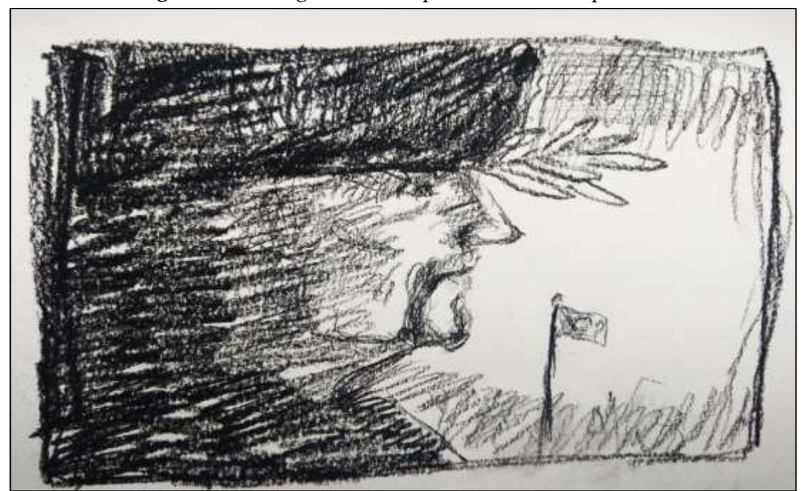
Figure 2: Drawing to the concept of "War of Independence"

The third and last sub-question of the research is "What are the metaphorical perceptions of the fourth grade students in primary school on Republic?", and the metaphors given by the students for this sub-question are shown in Table 5.