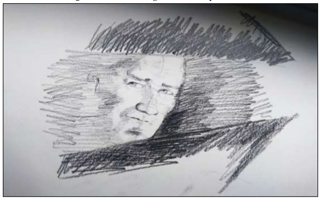
Figure 1: The drawing of the concept of "Atatürk"

The drawing of the concept of "Atatürk" based on the metaphors of the students is shown in Figure 1.