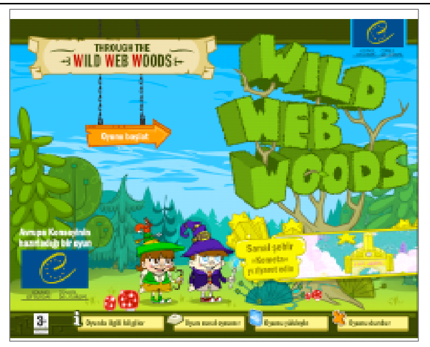
Figure 1: A screen shot from Wild Web Woods Game

This game was designed by Netzbewegung, German company, within the scope of a European Council program called "Construction of Europe for and with Children". The basic purpose of the game is to prepare users for safe Internet use by informing them about unsafe situations likely to be experienced while using the Internet. The game has a support for 27 different languages including Turkish. Each task to be fulfilled in the two-dimensional game is assigned in the form of a scenario. The characters in these scenarios are taken from various children's stories.