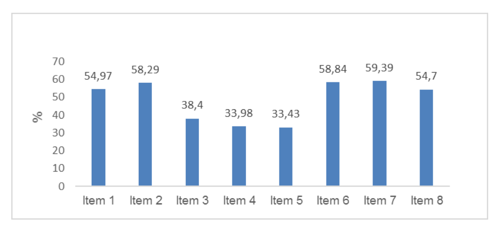
Figure 1: Comparison of the percentage of students who did not identify the errors

The results are shown by the following graph: