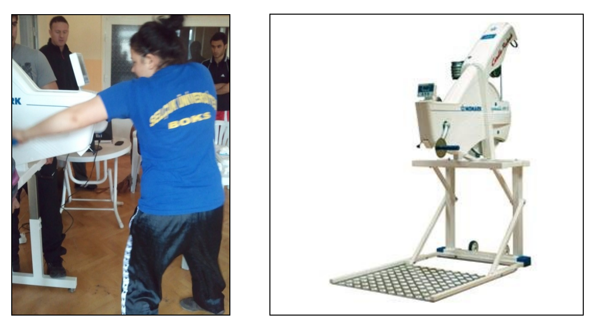
Figure 1: Monark 824 Model Arm Bicycle Ergometer

For the Wingate test Monark 824 model (made in Sweden) hand bike ergometer was used. With the 20% of the test loads calculated on the bicycle ergometer for the athletes, at a speed of 60-70 rpm, 4-8 seconds duration containing two or three sprint, a 5 minute warm-up protocol was applied. After warm up passive resting was provided for 3-5 minutes. Test was performed as specified in the protocol (Özkan et al 2010).Hand anaerobic power measurement is used as a load resistance of 50 gr / kg per kilogram of body weight for Monark ergometer (Özkan et al. 2010).