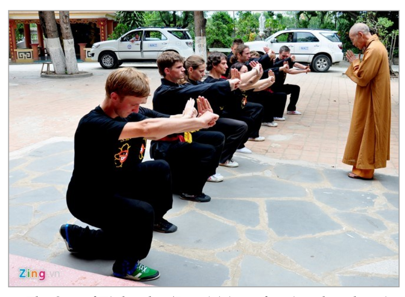
Figure 1: The Sect of Tinhvodao (Russia) is performing the salutation rite

According to Confucian deities, one of the noblest qualities to form human personality and individuality is righteousness. "Righteousness is at the same time the human dignity, rituals, political regulations, cultural and virtuous norms, which purely has standards of traditional philosophy of each nation and plays an extremely important role in the whole social life". With the cultural typicality and the tradition of "teacher deference, moral respect" of Vietnamese people, "righteousness" is always put to the top. It is a model, a measurement in all social communication