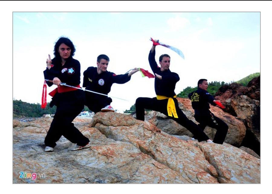
Figure 2: The practitioners of Little Dragons Sect (France) perform weapon lessons

Besides, Vocotruyen teaches the learners to practice breathing skill, inner force, outer force, attack and remedies for spots on the body, approaches combining martial arts with oriental medicine to cure injuries and joint sprains during the trainings and competitions.