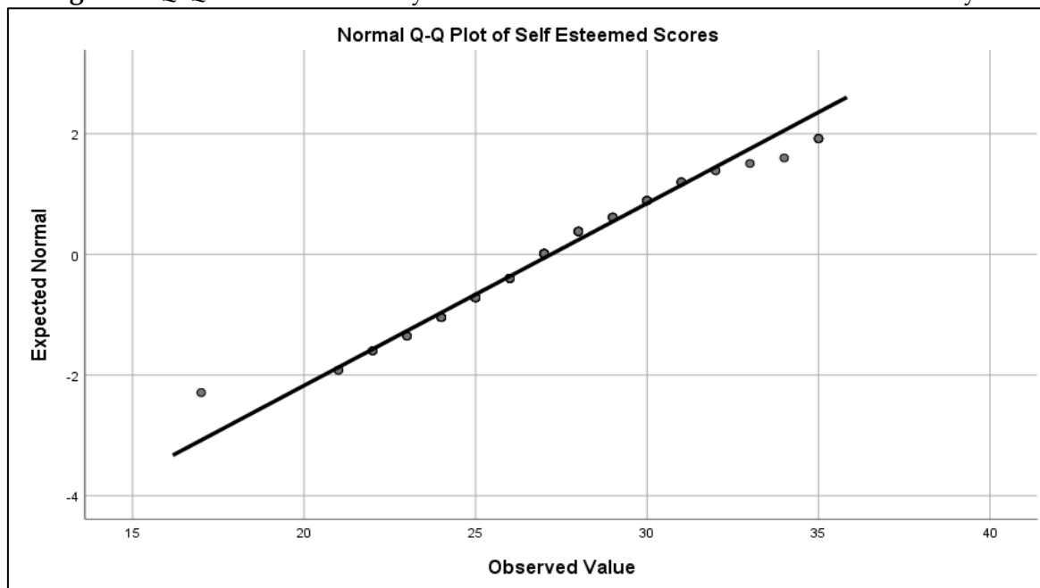
Figure 2: Q-Q Plot for Normality of across the Data of Self-Esteem of Soccer Players

Figure 2 illustrates the distribution of self-esteem data among soccer players. The points deviate both upward and downward at the extremes of the plot in relation to the 45-degree reference line, indicating that the self-esteem scale data does not follow a normal distribution.