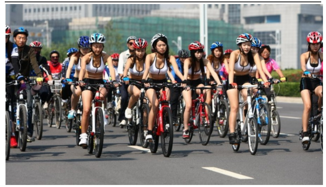
Figure 1: Cyclists ride in a campaign for low-carbon transport in Zhengzhou, capital of Henan province, which marked the World Car Free Day. [8]